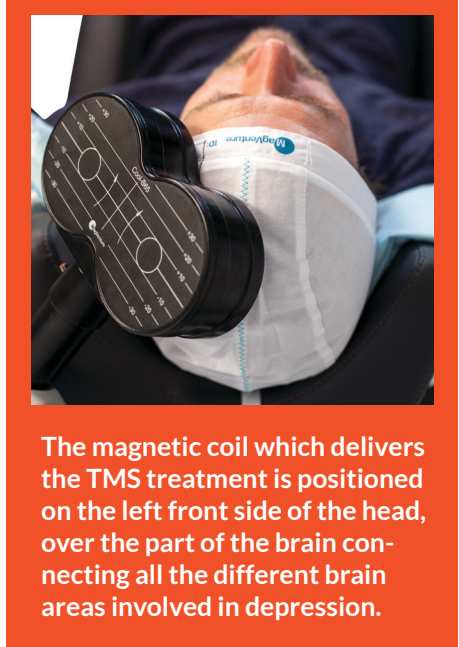
The magnetic coil which delivers the TMS treatment is positioned on the left front side of the head, over the part of the brain connecting all the different brain areas involved in depression.

The world's largest TMS trial to date found that 49% of the patients responded to the treatment, and 32% achieved full remission. 1 MagVenture TMS equipment was used for the trial.